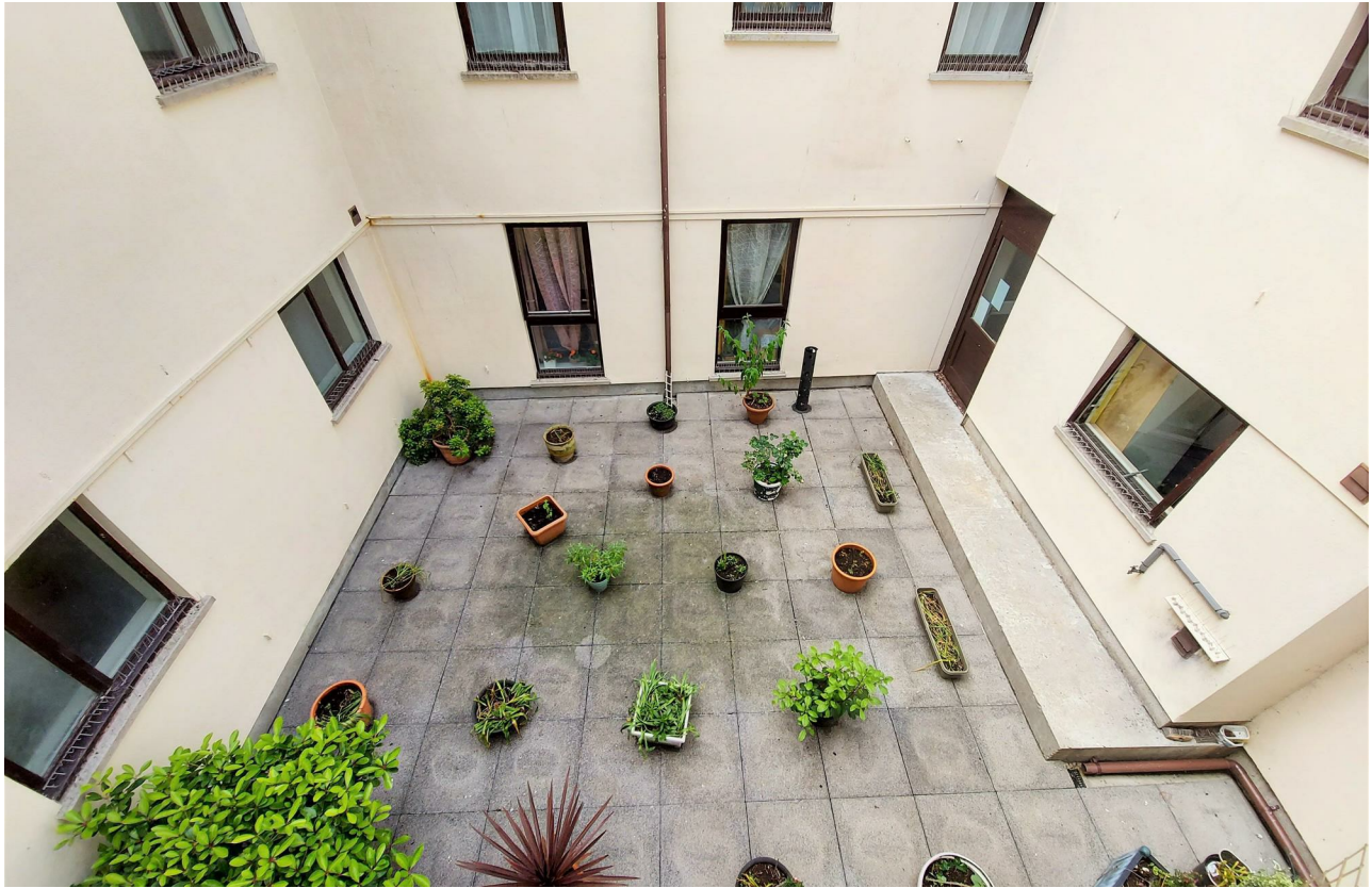
Society on the right hand side. The entrance to Market Court will be identified a short distance down on the right hand side.